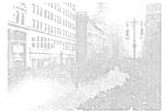
St. Patrick's Day parade in 1915

Cities across the country hold parades on St. Patrick's Day. The parades usually include Irish dancers and Irish music, often played by bagpipe bands.