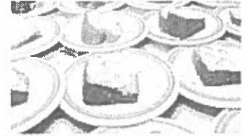
Green cake with shamrock icing

Irish food is popular on St. Patrick's day. Favorite dishes include corned beef and cabbage, colcannon, made with potatoes and kale; and Irish stew. Cakes and ice cream are usually green with green decorations.