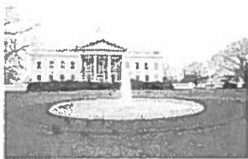
The White House fountain colored green for St. Patrick's Day

Ireland is nicknamed the "Emerald Isle" because of its green landscape. Green is therefore the color of St. Patrick's Day. Around the country, people celebrate by coloring things green, including rivers and fountains!