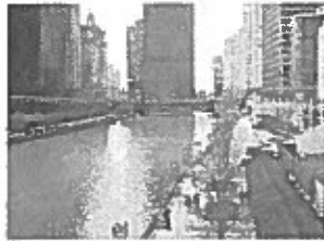
The Chicago River tinted green for St. Patrick's Day.